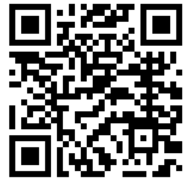
QR code to submit entry.

Your contest entry will be submitted digitally using the QR code to the right. The final story must be uploaded as a Google doc using Times New Roman font that is 12-point size and double-spaced.